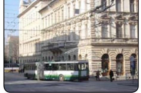
Reconstructed trolleybus junction Híd utca in Szeged

The TROLLEY partner Szeged Transport Company (SZKT) invested in a Trolleybus Corridor that aims at a better, intermodal public transport system in Szeged. Key elements that are funded by the TROLLEY project are the high-speed wires, crossings and switches which ensure a reduced number of trolley derailments as well as reduced vibrations in the neighbouring houses. Furthermore, SZKT reconstructs a trolleybus stop with special kerb elements to provide accessibility to low-floor trolleybuses. For this, SZKT reconstructed the overhead wires at the Híd utca - Vár utca trolleybus junction as well as the Híd utca trolleybus stop as pilot actions in the TROLLEY project. Thereupon, SZKT produced a report, which can serve as a manual for im-