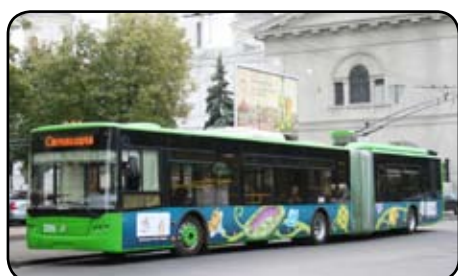
An articulated converted trolleybus in Charkow

Three games of the European football championship took place in the city, which is situated ap-