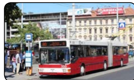
MAN/G&S articulated trolleybus 350, previously Eberswalde, since 15 June 2012 operating in regular service on bus route 80

buses could be kept low, the purchase was made at € 38,000 per vehicle, plus transfer cost of € 8,700 and costs for overhaul and adaptation to Hungarian conditions amounting to € 54,000. Including duties, the total price per vehicle is € 103,000. These are the first low-floor articulated buses for Budapest, so far only solo vehicles were purchased in the low-floor variant. Furthermore, the new vehicles are more energy-efficient than the previous 99 articulated trolleybuses, which were procured from 1987 until 1996. A decrease in energy