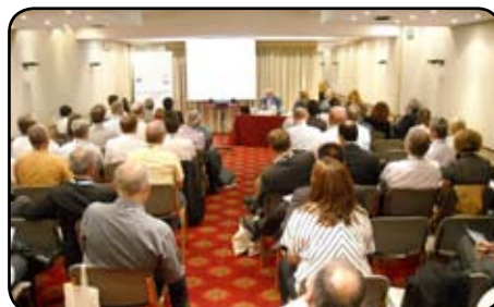
Knowledge Exchange during TROLLEY's & UITP's joint meeting in Parma

UITP Trolleybus Working Group, were followed by an introductory presentation about the TROLLEY project. Afterwards a TROLLEY Roadmap of project activities till the end of 2012 was presented and the UITP Trolleybus Working Group members were invited to make use of TROLLEY's outputs, e.g. planned manuals for energy storage systems or TROLLEY's image campaign "ebus - the smart way!", or to join TROLLEY initiatives like the European Trolleybus Day. The TROLLEY partners and the UITP Trolleybus Working Group members agreed to intensify cooperation and to extend a further knowledge exchange according to topical issues of the seven internal "project teams" of the UITP Trolleybus Working Group in various trolleybus areas at future meetings.