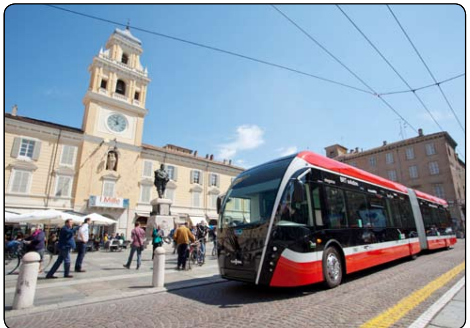
The new "e-bus" for Parma

Parma has been using trolleybuses for nearly 60 years. This non-polluting and silent solution is welcome to the city. Recently Tep has chosen 9 new appealing tramlook vehicles produced by VanHool. The new 18 meter long vehicles will be used on line 5, the most used of the city with its 12,000 passengers per day, crossing Parma from East to West. The first of the new trolleybuses was inaugurated on May 4th 2012, during the 16th UITP Trolleybus Working Group meeting, in the presence of local and regional authorities. The new trolleybuses will be equipped with supercapacitors, which are co-funded as pilot investment by the TROLLEY project. This technology allows the recovery