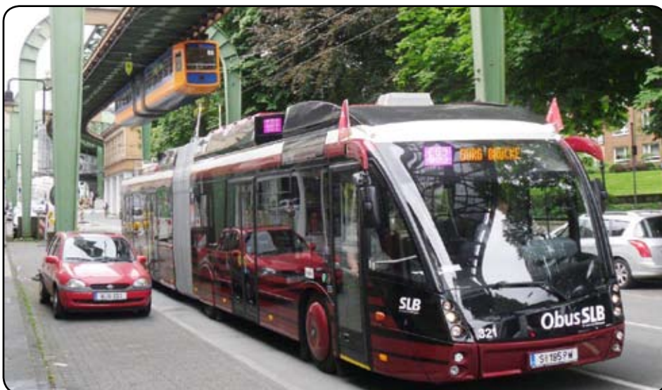
Trollino MetroStyle from the TROLLEY partner city Salzburg visiting the German trolleybus city Solingen/Wuppertal

TROLLEY website www.trolley-project.eu (login information and further instructions). The eLearning module enables users to learn quickly and conveniently about trolleybus basics regardless of distance and time. The module is available in English. Further modules about energy storage systems for trolleybuses and the take-up of trolleybus systems are expected for the end of 2012 and all three modules will build up an full eLearning course. Furthermore, TROLLEY established a European Trolleybus Knowledge Center. It shall serve as main European information hub on trolleybuses providing contacts to European trolleybus experts (pool of experts) and the most relevant links and documents (library) to all those, who wish to learn more about trolleybus systems. Additionally, the Knowledge Center contains a Trolleybus Wiki, which includes technical information about key elements of trolleybus systems and users or the experts respectively can add and edit their expert knowledge and information. The TROLLEY Knowledge Center is integrated into the website of the TROLLEY partner trolley:motion – an international action group to promote e-bus systems with zero emissions - and is available via http://www.trolleyemotion.ch .